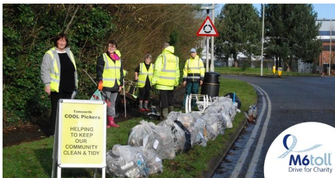
Cleaner Tamworth Litter pickers