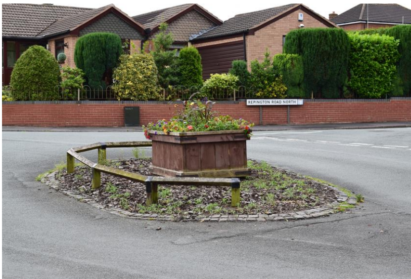
Figure 6: Round-a-bout at junction of The Green and Repington Road Nth