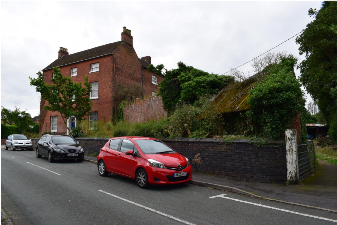
Figure 4: Amington House (Grade II) and the outbuilding to the side which has collapsed