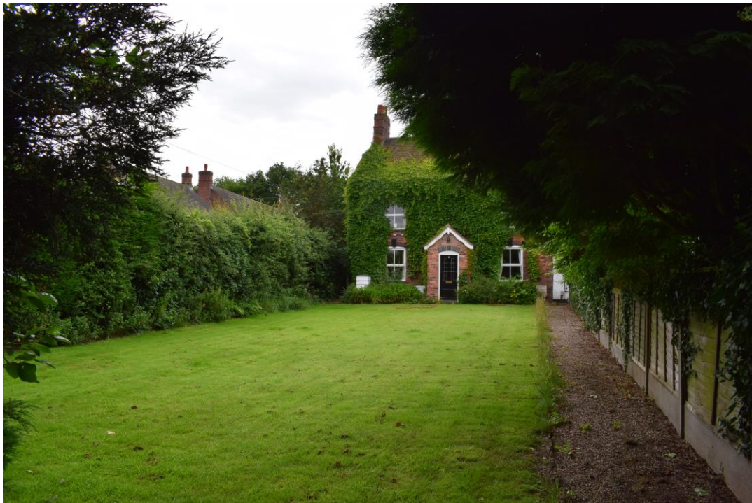
Figure 5: No 12 The Green with large amounts of vegetation growing on the facade