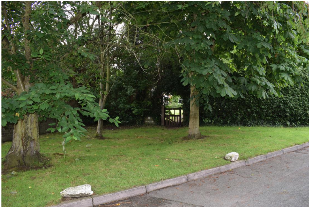
Figure 3: Location of the Former Village Pound