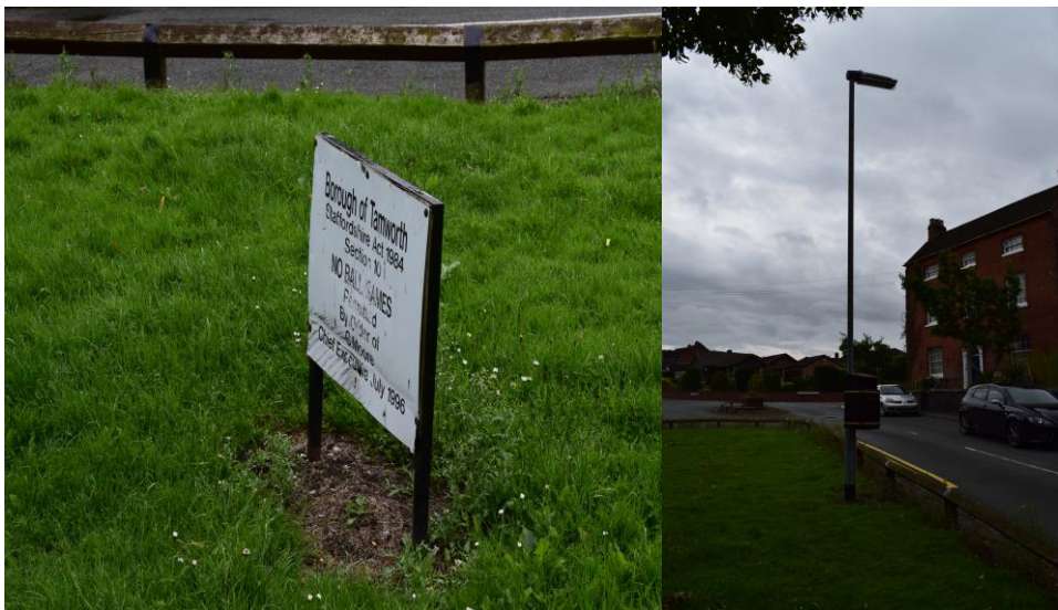
Figure 7: No ball games sign and light post with attached bin.