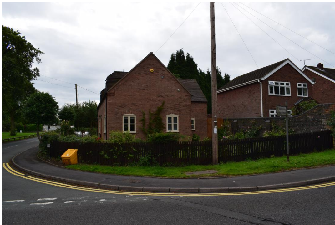
Figure 2: Development of open green space